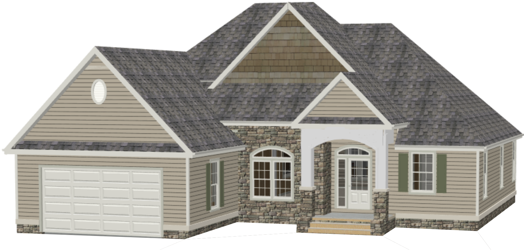
The Oakmont 1825 SF